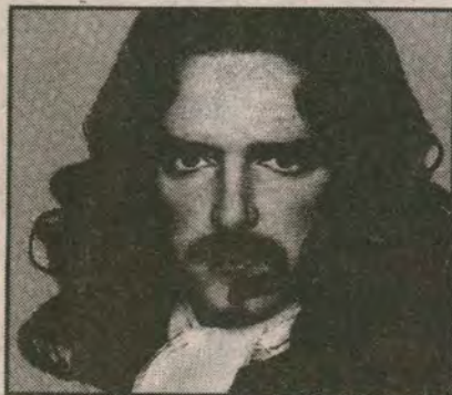
The Question Marquis

I clearly remember all those Super Bowl blowouts, as do most football fans. Yet we can not manage to pry ourselves away from the grandest spectacle in our sports culture; even though it is generally a let down. What makes it interesting is that we still tune in, 131 million strong, hoping for a good game.