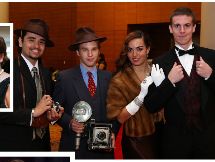
Harper drama students added to the evening's fun by transforming themselves into Hollywood glam from the past.