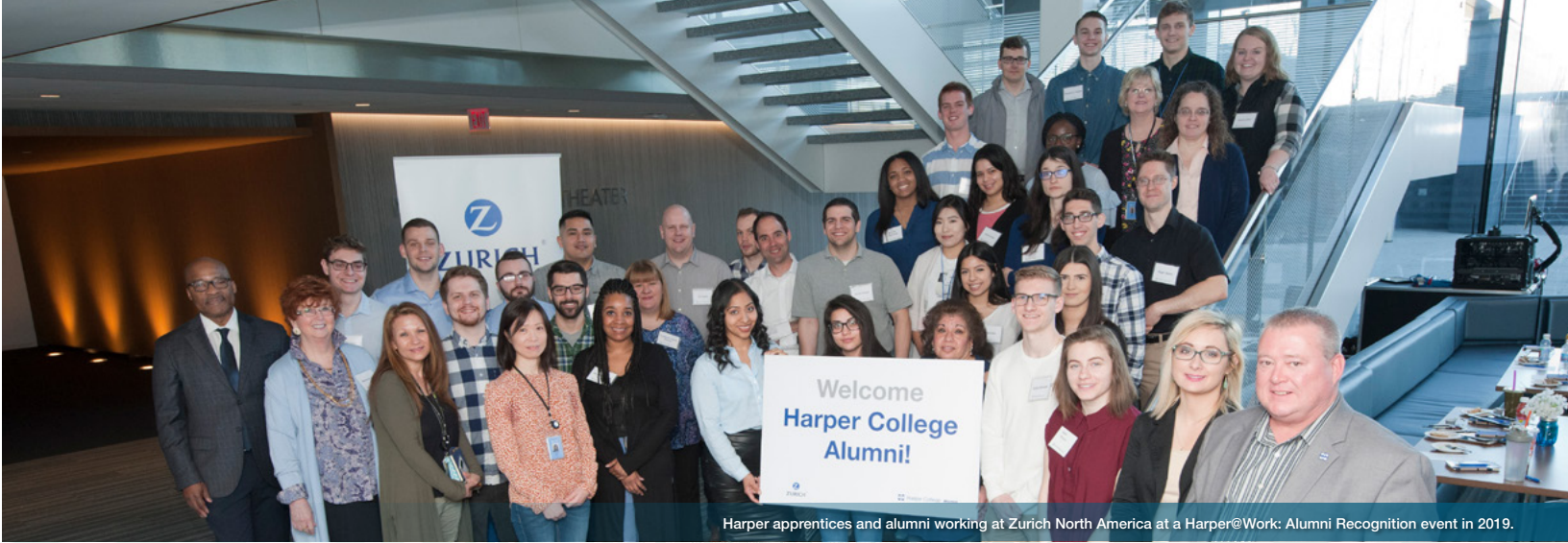
Harper apprentices and alumni working at Zurich North America at a Harper@Work: Alumni Recognition event in 2019.