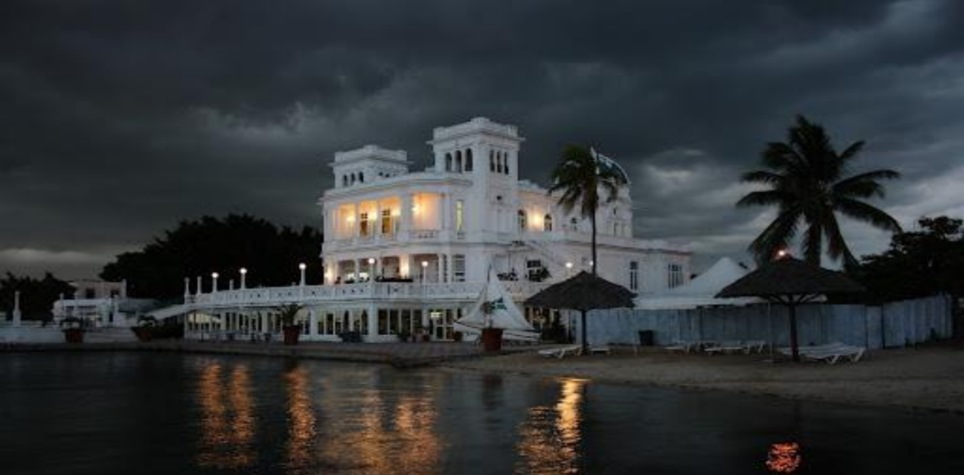
Cienfuegos Yacht Club