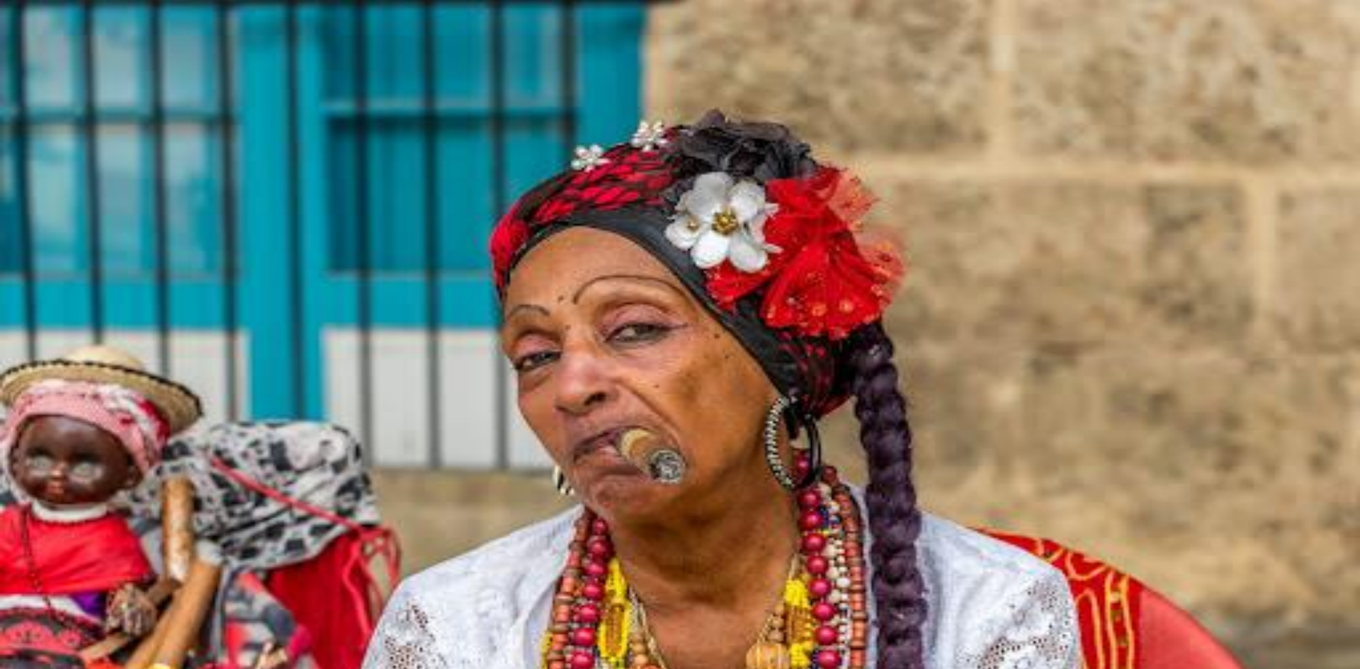
Woman Posing for Trinidad Tourists