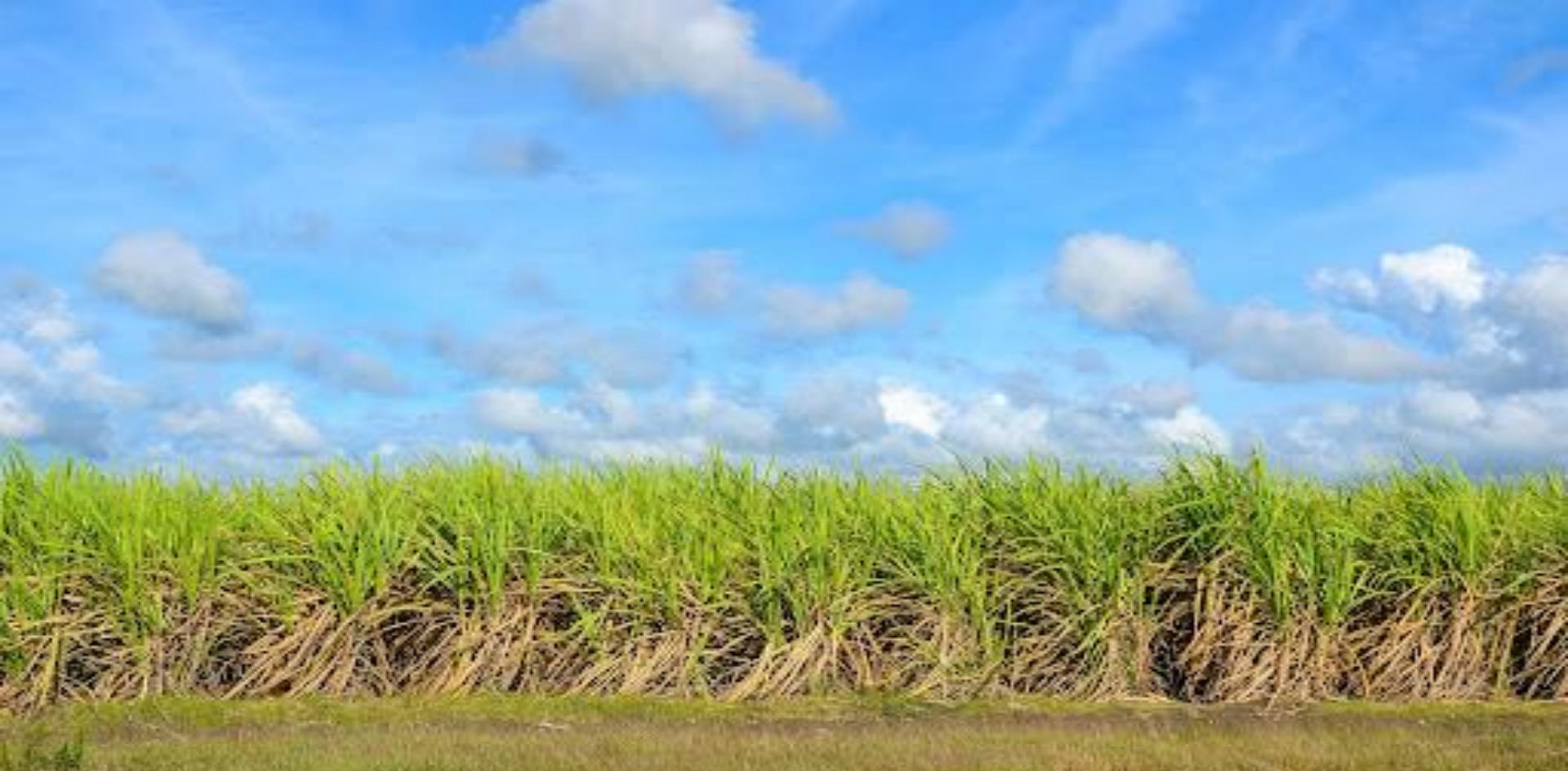
Sugarcane field in Cuba